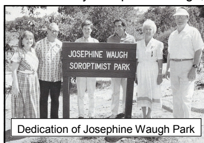
Dedication of Josephine Waugh Park