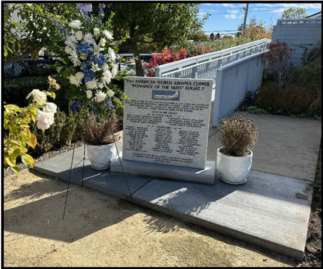
Pan American Flight 7