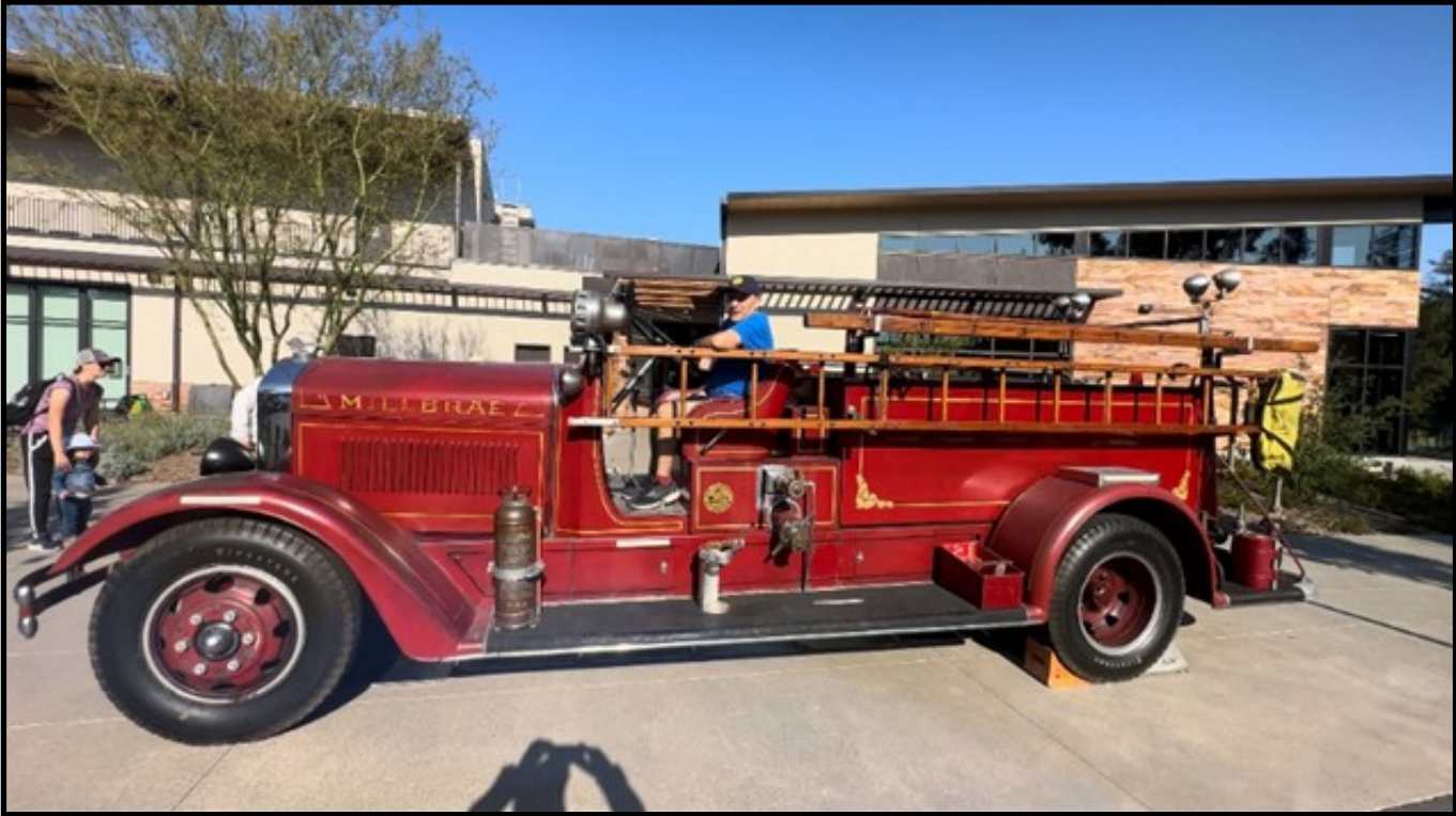
1936 American LaFrance Fire Engine