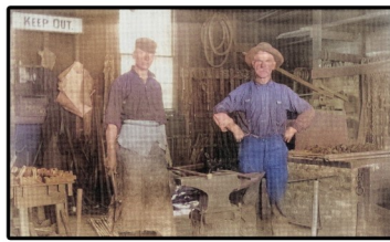
Alfred Gee's Blacksmith Shop