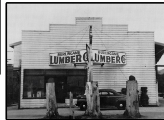
Phillips Family Lumber Yard