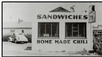
"Doc" Kirby's Chili Parlor