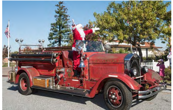
1936 American LaFrance Fire Engine

Pictured at right is the Pan American Flight 7 Memorial on the grounds of the Millbrae Museum. Pan Am Flight 7 departed San Francisco International Airport bound for Honolulu on November 8, 1957, then disappeared into the Pacific with the loss of forty-four souls. The memorial was paid for by the Pan Am Flight 7 Memorial Committee and placed on the Museum grounds as a joint effort with the City of Millbrae and the Millbrae Historical Society. The Pan Am Flight 7 Memorial Committee is composed of family and friends who lost their loved ones on that tragic flight. Next time you are in Constitution Square , come by and check out the Pan Am Memorial.