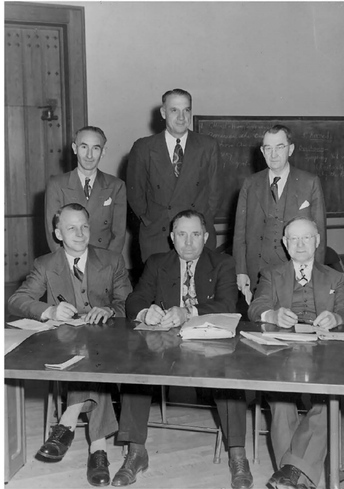
First Meeting of the Millbrae City Council - 01/20/1948