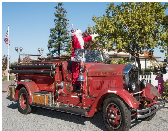
1936 American La France

Where can I find this fantastic 4 th of July celebration?