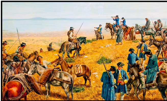
Depiction of first European sighting of San Francisco Bay by the Gaspar de Portolá Expedition

Millbrae Historical Society President 2009—present