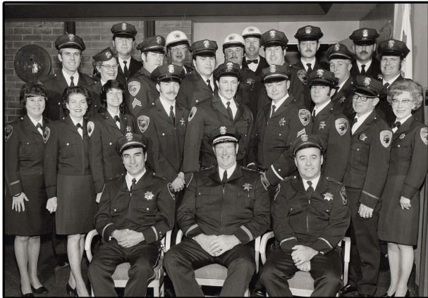
MPD Group shot for Millbrae's 25th Anniversary (1973)