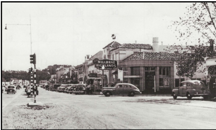
Corner of El Camino Real and Hillcrest Blvd in the mid-1940s