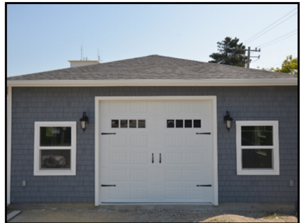
Current state of Millbrae Carriage House , as of September 2017.