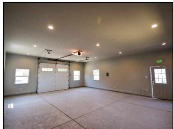
Interior of the new Millbrae Carriage House .