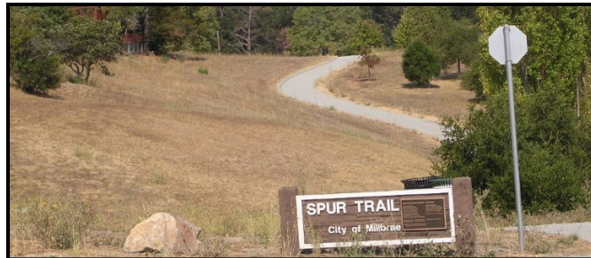
Millbrae's popular Spur Trail was once the planned route for the Junipero Serra Highway

If you ask the average person on the street in Millbrae, "What was Highway District 10 ?", I would bet that most people have never heard of it. This proposed infrastructure project would have split Millbrae in half, and Millbrae would be much different than it is today, but fortunately it never happened. Highway District 10 owned the rights to extend Junipero Serra Boulevard through Millbrae. In 1951, the project was moving south, and the extension was already under construction between Sneath Lane and Crystal Springs Road in San Bruno. The new plan was presented to the public with the proposed route running through Millbrae ending up at Trousdale Drive.