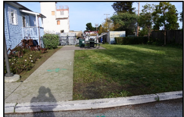
Millbrae Carriage House site as it looked in April 2017.

Millbrae Historical Society President 2009 – Present