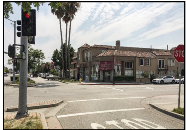
Same corner today - some original buildings remain